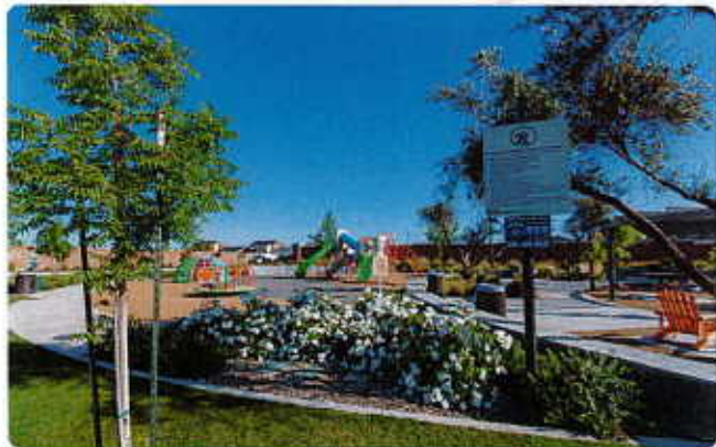
Riverstone Expedition Park, Madera , CA