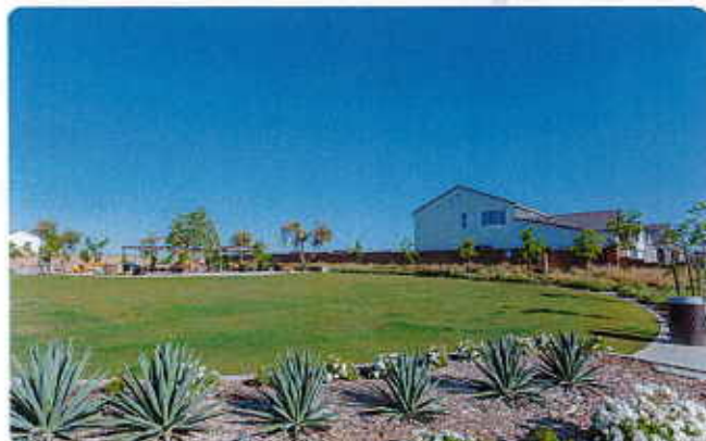
Expedition Park, Madera, CA