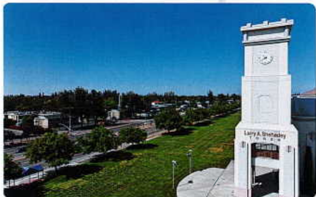
Savemart Center, Fresno, CA