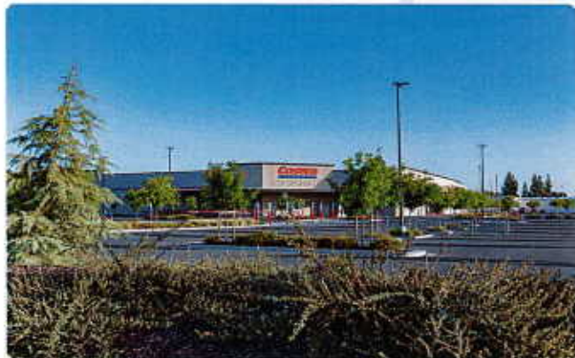
Costco, Clovis, CA