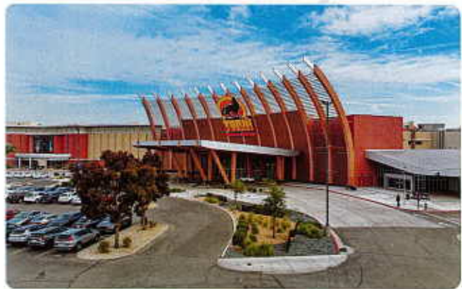
Tachi Palace Casino Resort, Lemoore, CA