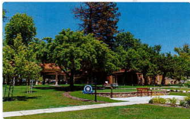
Cal Armenian Homes, Fresno, CA