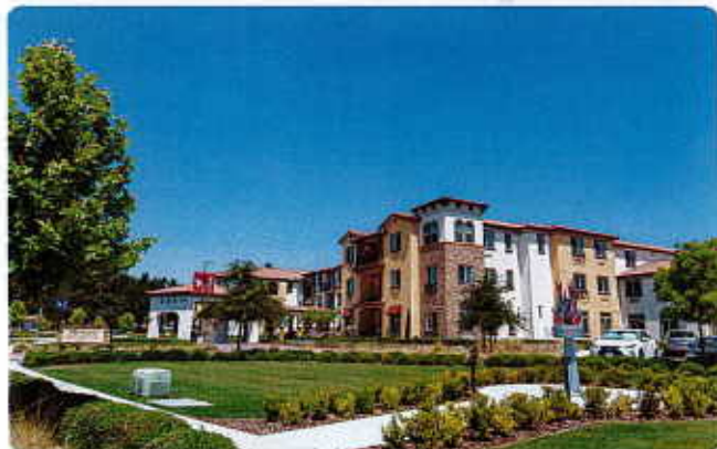
Cal Armenian Homes, Fresno, CA