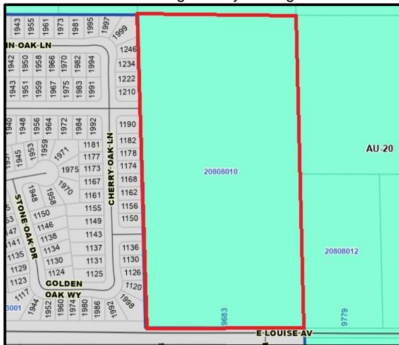
Existing County Zoning