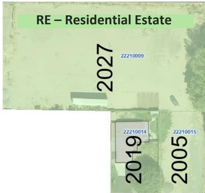
Exhibit 'A-1' Current Zoning

2019 Wawona APN 222-100-14 2005 Wawona APN 222-100-15 2027 Wawona APN 222-100-09