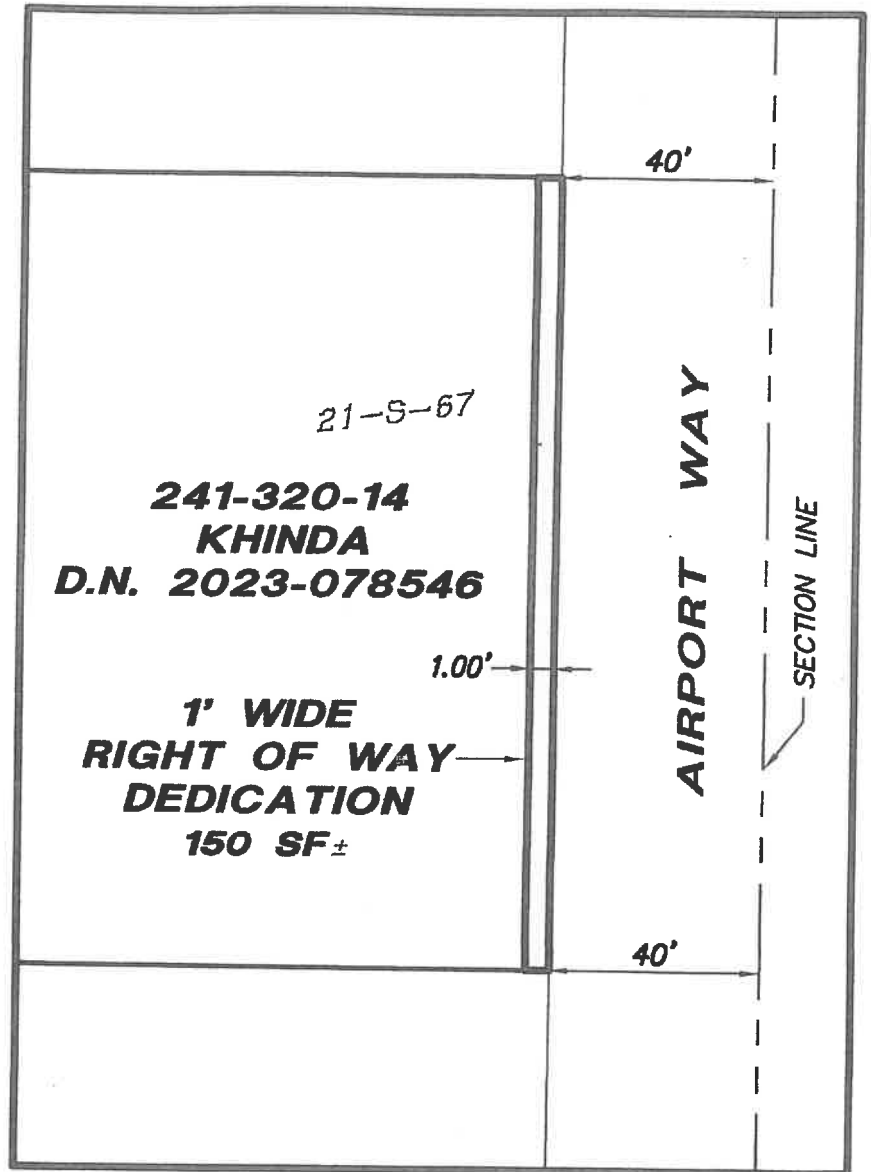
DETAIL NOT TO SCALE