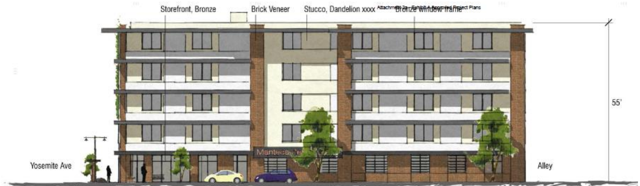
EAST ELEVATION - NTS